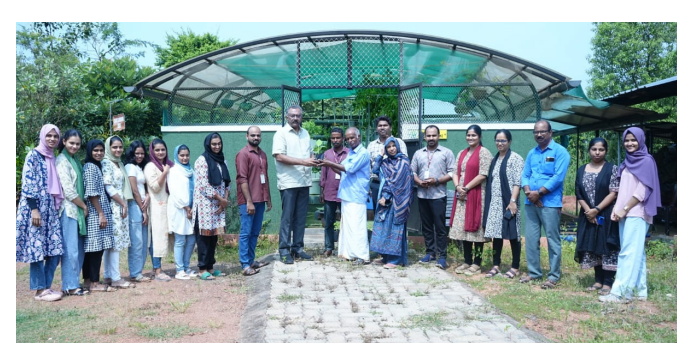
DISTRIBUTION OF TISSUE CULTURED BANANA SEEDLINGS FROM SAFI