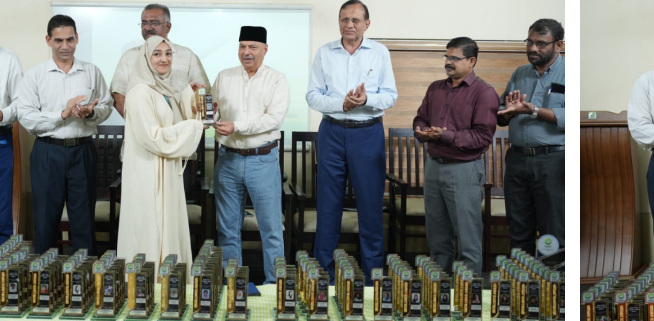
SAFI PTA MERIT DAY