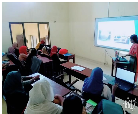
Presentation by students