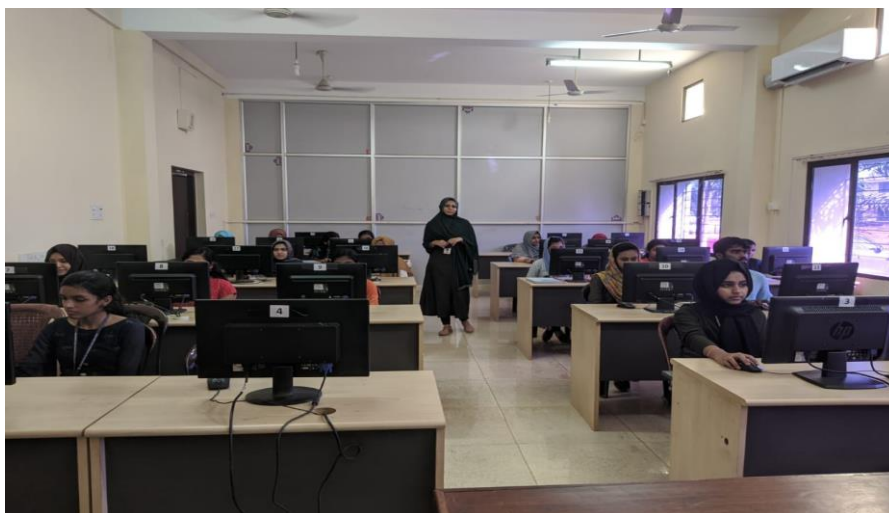
From the session