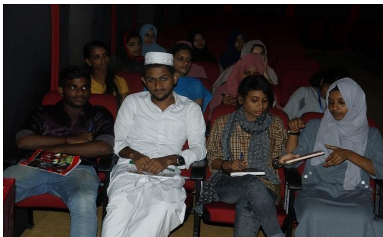
From the session